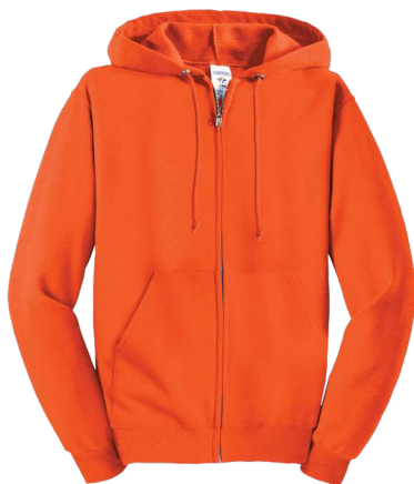
JERZEES® NuBlend® Full-Zip Hooded Sweatshirt 993M | Adult Sizes: S-3XL