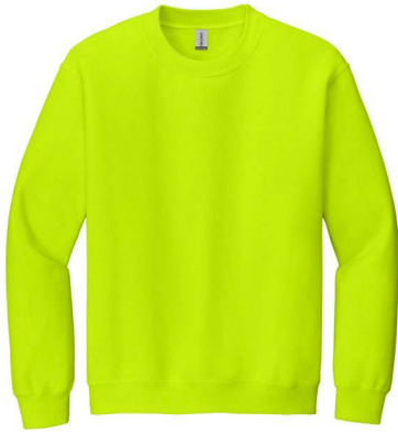
GILDAN® Heavy Blend™ Crewneck Sweatshirt 18000 | Adult Sizes: S-5XL