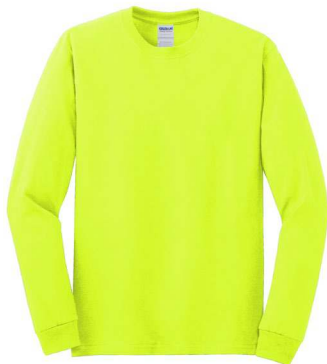
GILDAN® Heavy Cotton™ 100% Cotton Long Sleeve T-Shirt 5400 | Adult Sizes: S-3XL