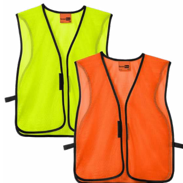
CORNERSTONE® Enhanced Visibility Mesh Vest CSV01 | One Size Fits Most