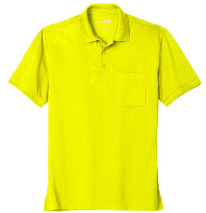
CORNERSTONE® Industrial Snag-Proof Pique Pocket Polo CS4020P | Adult Sizes: XS-6XL