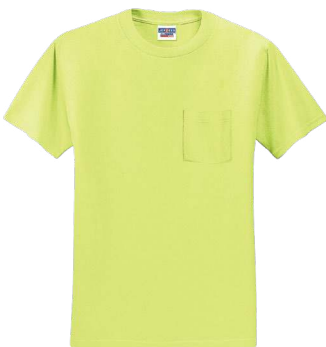
JERZEES® Dri-Power® 50/50 Cotton/Poly Pocket T-Shirt 29MP | Adult Sizes: S-3XL