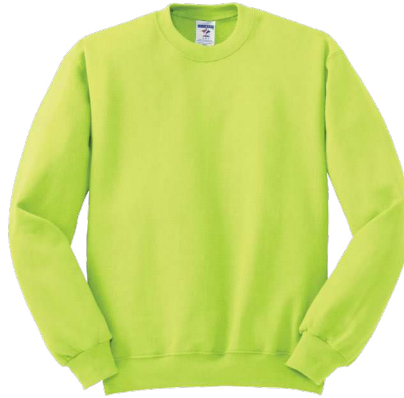
JERZEES® NuBlend® Crewneck Sweatshirt 562M | Adult Sizes: S-4XL