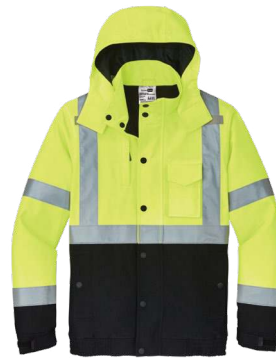
CORNERSTONE® ANSI 107 Class 3 Waterproof Insulated Ripstop Bomber Jacket CSJ501 | Adult Sizes: S-5XL