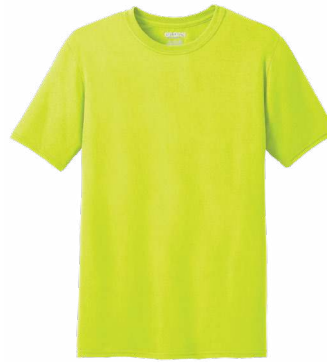
GILDAN Performance® T-Shirt 42000 | Adult Sizes: S-3XL