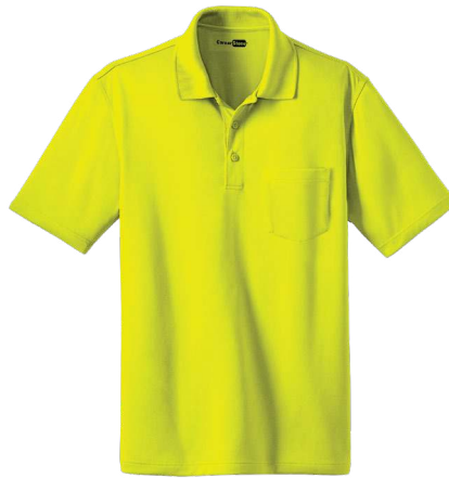
CORNERSTONE® Select Snag-Proof Pocket Polo CS412P | Adult Sizes: XS-4XL