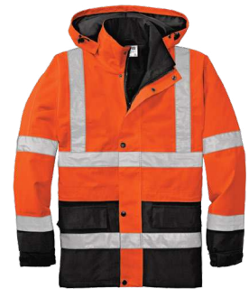
CORNERSTONE® ANSI 107 Class 3 Waterproof Parka CSJ24 | Adult Sizes: S-4XL