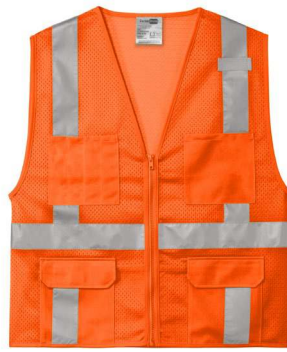
CORNERSTONE® ANSI 107 Class 2 Mesh Six- Pocket Zippered Vest CSV104 | Adult Sizes: S/M, L/XL, 2XL/3XL, 4XL/5XL