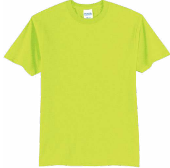
PORT & COMPANY® Core Blend Tee PC55 | PC55T | PC55Y | Adult Sizes: S-6XL | Tall Sizes: LT-4XLT | Youth Sizes: XS-XL