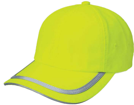
PORT AUTHORITY® Enhanced Visibility Cap C836