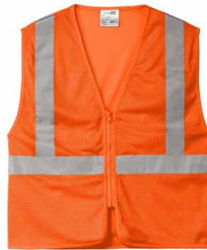
CORNERSTONE® ANSI 107 Class 2 Economy Mesh Zippered Vest CSV101 | Adult Sizes: S/M, L/XL, 2XL/3XL, 4XL/5XL