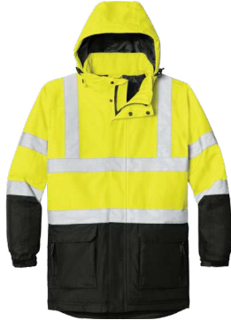
PORT AUTHORITY ANSI 107 Class 3 Safety Heavyweight Parka J799S | Adult Sizes: XS-4XL