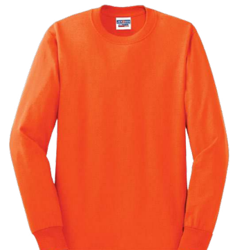
JERZEES® Dri-Power® 50/50 Cotton/ Poly Long Sleeve T-Shirt 29LS | Adult Sizes: S-3XL