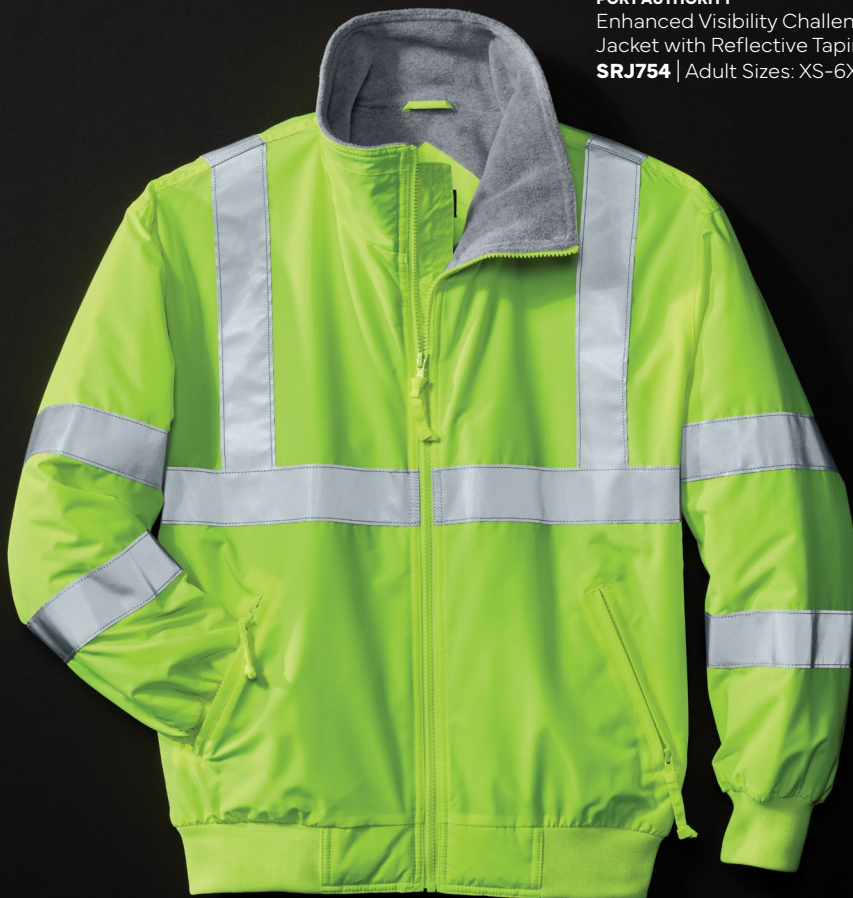
PORT AUTHORITY® Enhanced Visibility Challenger™ Jacket with Reflective Taping SRJ754 | Adult Sizes: XS-6XL