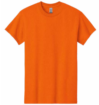
GILDAN® Heavy Cotton™ 100% Cotton T-Shirt 5000 | 5000B | Adult Sizes: S-3XL | Youth Sizes: XS-XL