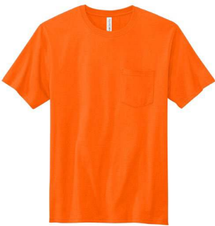
VOLUNTEER KNITWEAR™ All-American Pocket Tee VL100P | Adult Sizes: S-4XL