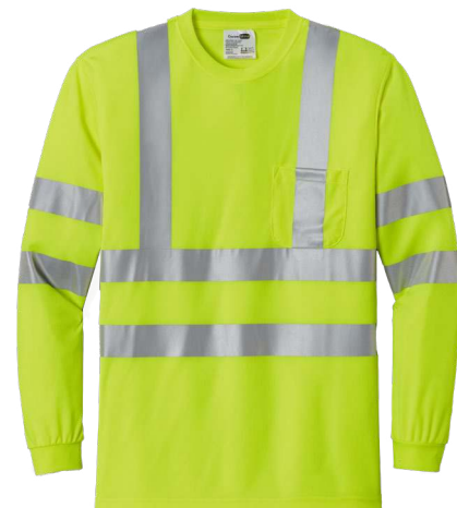
CORNERSTONE® ANSI 107 Class 3 Long Sleeve Snag-Resistant Reflective T-Shirt CS409 | Adult Sizes: XS-4XL