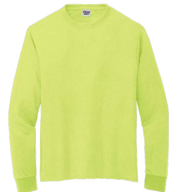
JERZEES® Dri-Power® 100% Polyester Long Sleeve T-Shirt 21LS | Adult Sizes: S-3XL