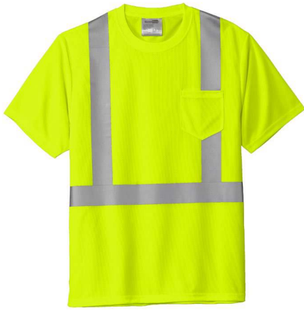
CORNERSTONE® ANSI 107 Class 2 Mesh Tee CS200 | Adult Sizes: S-5XL