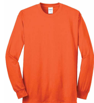
PORT & COMPANY® Long Sleeve Core Blend Tees PC55LS | PC55LST | Adult Sizes: S-6XL | Tall Sizes: LT-4XLT