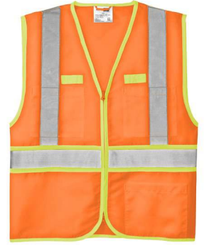
CORNERSTONE® ANSI 107 Class 2 Dual-Color Safety Vest CSV407 | Adult Sizes: S-4XL