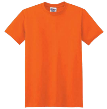
JERZEES® Dri-Power® 100% Polyester T-Shirt 21M | Adult Sizes: S-3XL