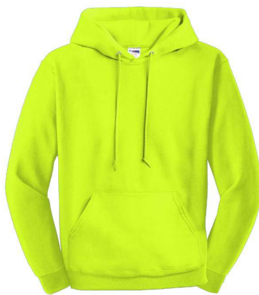
JERZEES® Super Sweats® NuBlend® Pullover Hooded Sweatshirt 4997M | Adult Sizes: S-3XL