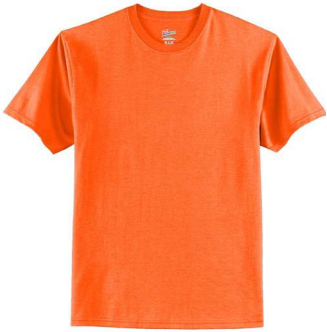
HANES® Authentic 100% Cotton T-Shirt 5250 | Adult Sizes: S-5XL