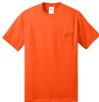
PORT & COMPANY® Core Blend Pocket Tees PC55P | PC55PT Adult Sizes: S-6XL | Tall Sizes LT-4XLT