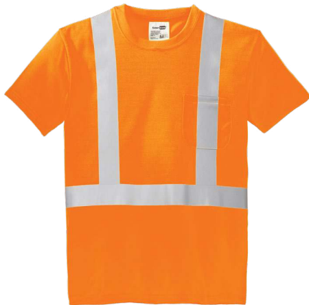
CORNERSTONE® ANSI 107 Class 2 Safety T-Shirt CS401 | Adult Sizes: XS-4XL