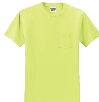
JERZEES® Dri-Power® 50/50 Cotton/ Poly T-Shirts 29M | 29B | Adult Sizes: S-5XL | Youth Sizes: XS-XL