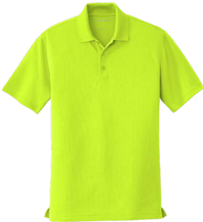
PORT AUTHORITY® Dry Zone® UV Micro-Mesh Polo KT10 | Adult Sizes: XS-6XL