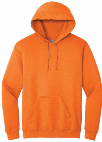
GILDAN® Heavy Blend™ Hooded Sweatshirt 18500 | Adult Sizes: S-5XL