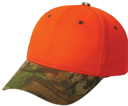
PORT AUTHORITY® Enhanced Visibility Cap with Camo Brim C804