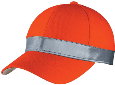
CORNERSTONE® ANSI 107 Safety Cap CS802