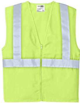
CORNERSTONE® ANSI 107 Class 2 Safety Vest CSV400 | Adult Sizes: S/M, L/ XL, 2XL/3XL