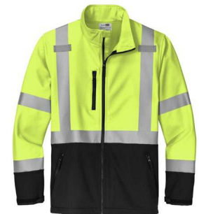
CORNERSTONE® ANSI 107 Class 3 Soft Shell Jacket CSJ503 | Adult Sizes: S-5XL