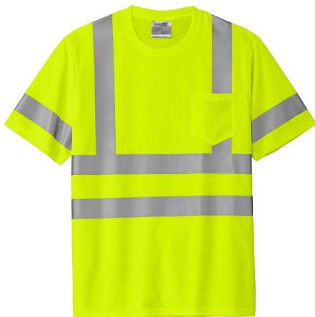
CORNERSTONE® ANSI 107 Class 3 Mesh Tee CS202 | Adult Sizes: M-5XL