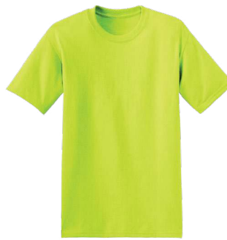
HANES® EcoSmart® 50/50 Cotton/Poly T-Shirt 5170 | Adult Sizes: S-4XL