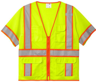
CORNERSTONE® ANSI 107 Class 3 Surveyor Mesh Zippered Two-Tone Short Sleeve Vest CSV106 | Adult Sizes: M-5XL