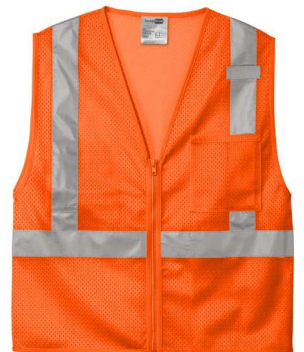
CORNERSTONE® ANSI 107 Class 2 Mesh Zippered Vest CSV102 | Adult Sizes: S/M, L/XL, 2XL/3XL, 4XL/5XL