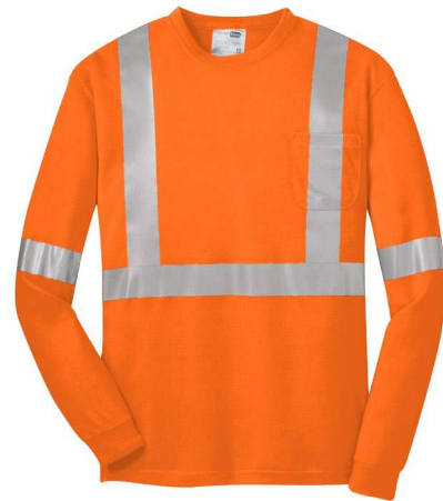
CORNERSTONE® ANSI 107 Class 2 Long Sleeve Safety T-Shirt CS401LS | Adult Sizes: XS-4XL