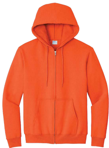
PORT & COMPANY® Essential Fleece Full-Zip Hooded Sweatshirts PC90ZH | PC90ZHT | Adult Sizes: S-4XL Tall Sizes: LT-4XLT