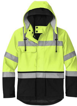
CORNERSTONE® ANSI 107 Class 3 Waterproof Ripstop 3-in-1 Parka CSJ502 | Adult Sizes: S-5XL