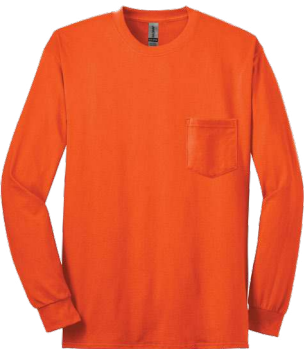
GILDAN® Ultra Cotton® 100% US Cotton Long Sleeve T-Shirt with Pocket 2410 | Adult Sizes: S-5XL