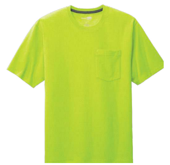
CORNERSTONE® Workwear Pocket Tee CS430 | Adult Sizes: S-4XL