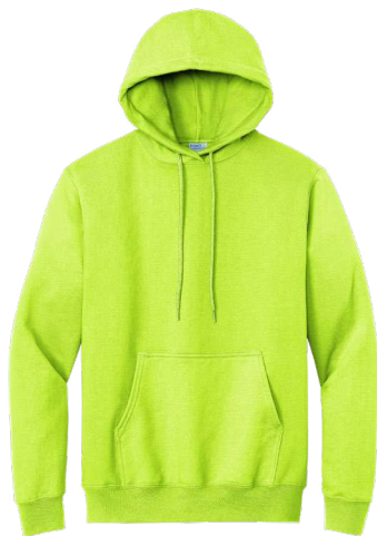
PORT & COMPANY® Essential Fleece Pullover Hooded Sweatshirts PC90H | PC90HT | Adult Sizes: S-4XL Tall Sizes: LT-4XLT