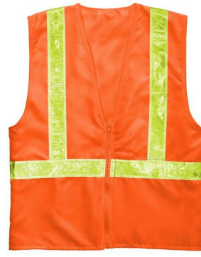
PORT AUTHORITY Enhanced Visibility Vest SV01 | Adult Sizes: S/M, L/XL, 2XL/3XL