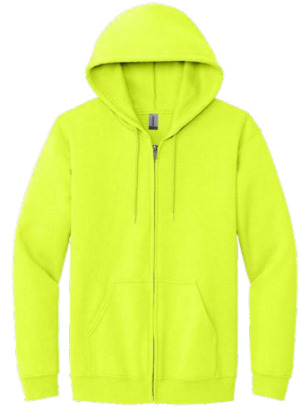
GILDAN® Heavy Blend™ Full-Zip Hooded Sweatshirt 18600 | Adult Sizes: S-5XL