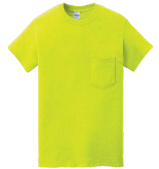
GILDAN® Heavy Cotton™ 100% Cotton Pocket T-Shirt 5300 | Adult Sizes: S-3XL