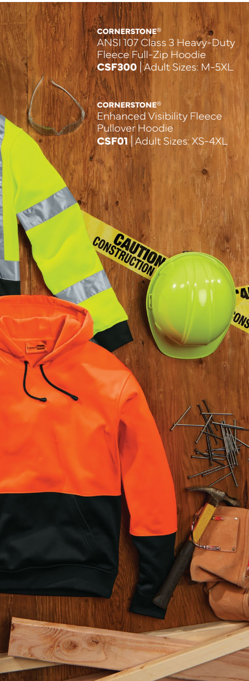
CORNERSTONE® ANSI 107 Class 3 Heavy-Duty Fleece Full-Zip Hoodie CSF300 | Adult Sizes: M-5XL