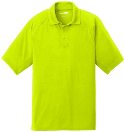
CORNERSTONE® Select Lightweight Snag-Proof Tactical Polo CS420 | Adult Sizes: XS-4XL