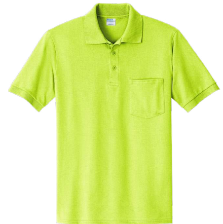
PORT & COMPANY® Core Blend Jersey Knit Polos KP55 | KP55T | Adult Sizes: XS-6XL Tall Sizes: LT-4XLT