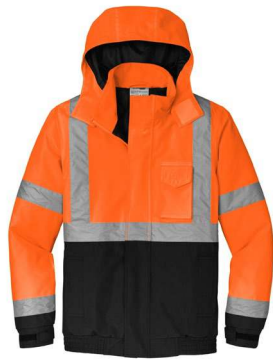
CORNERSTONE® ANSI 107 Class 3 Economy Waterproof Insulated Bomber Jacket CSJ500 | Adult Sizes: S-5XL