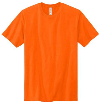
HANES® Cool Dri® Performance T-Shirt 4820 | Adult Sizes: XS-3XL