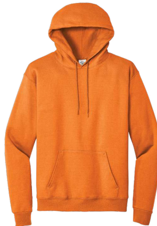
HANES® EcoSmart® Pullover Hooded Sweatshirt P170 | Adult Sizes: S-5XL