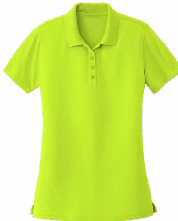
PORT AUTHORITY® Ladies Dry Zone® UV Micro-Mesh Polo LK110 | Adult Sizes: XS-4XL