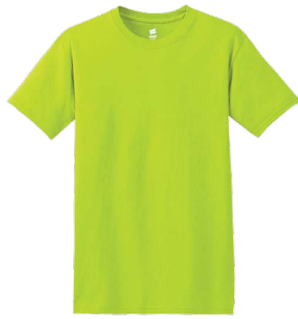
HANES® Essential-T 100% Cotton T-Shirt 5280 | Adult Sizes: S-3XL