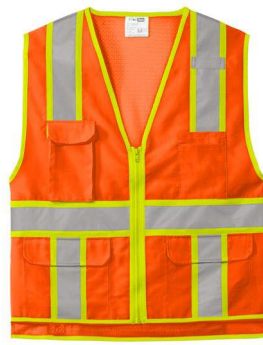
CORNERSTONE® ANSI 107 Class 2 Surveyor Zippered Two-Tone Vest CSV105 | Adult Sizes: S/M, L/XL, 2XL/3XL, 4XL/5XL