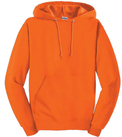
JERZEES® NuBlend® Pullover Hooded Sweatshirt 996M | Adult Sizes: S-4XL