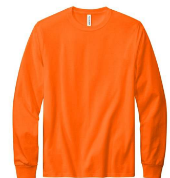
VOLUNTEER KNITWEAR™ All-American Long Sleeve Tee VL100LS | Adult Sizes: S-4XL