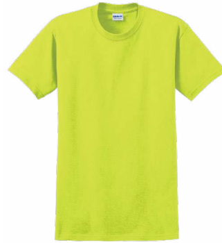
GILDAN® Ultra Cotton® 100% US Cotton T-Shirts 2000 | 2000T | 2000B | Adult Sizes: S-5XL | Tall Sizes: LT-3XLT | Youth Sizes: XS-XL