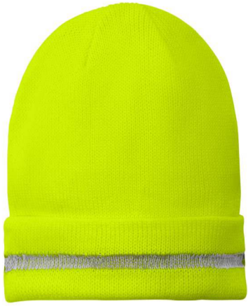
CORNERSTONE® Enhanced Visibility Beanie with Reflective Stripe CS800