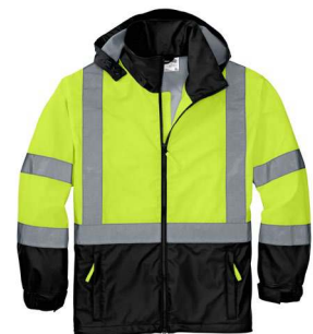
CORNERSTONE® ANSI 107 Class 3 Safety Windbreaker CSJ25 | Adult Sizes: S-4XL