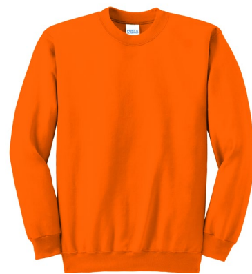
PORT & COMPANY® Essential Fleece Crewneck Sweatshirts PC90 | PC90T | Adult Sizes: S-4XL Tall Sizes: LT-4XLT