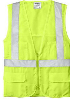
CORNERSTONE® ANSI 107 Class 2 Mesh Back Safety Vest CSV405 | Adult Sizes: S-4XL