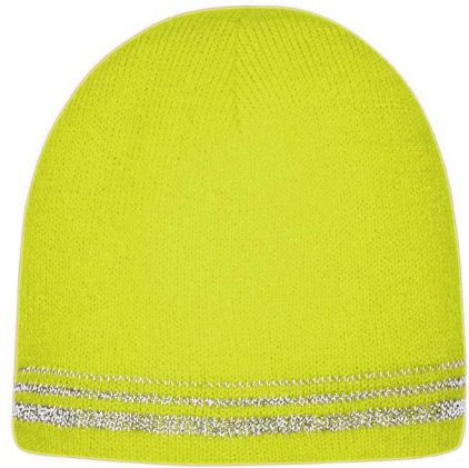
CORNERSTONE® Lined Enhanced Visibility with Reflective Stripes Beanie CS804