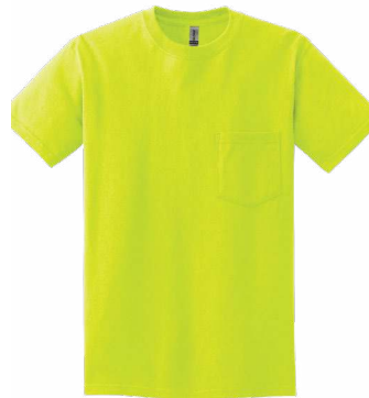
GILDAN® Ultra Cotton® 100% US Cotton T-Shirt with Pocket 2300 | Adult Sizes: S-5XL