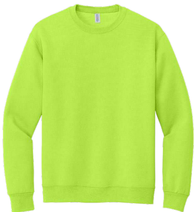
JERZEES® Super Sweats® NuBlend® Crewneck Sweatshirt 4662M | Adult Sizes: S-3XL