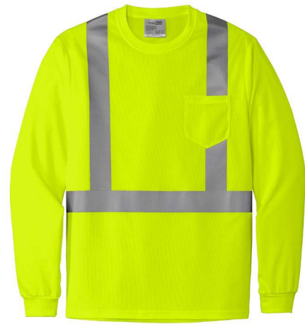
CORNERSTONE® ANSI 107 Class 2 Mesh Long Sleeve Tee CS201 | Adult Sizes: S-5XL