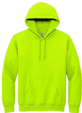
GILDAN® DryBlend® Pullover Hooded Sweatshirt 12500 | Adult Sizes: S-3XL