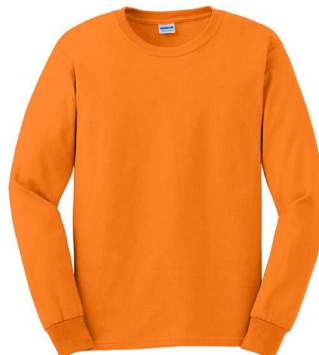
GILDAN® Ultra Cotton® 100% US Cotton Long Sleeve T-Shirt G2400 | Adult Sizes: S-5XL