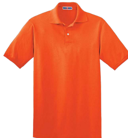
JERZEES® SpotShield™ 5.4-Ounce Jersey Knit Sport Shirt 437M | Adult Sizes: S-4XL